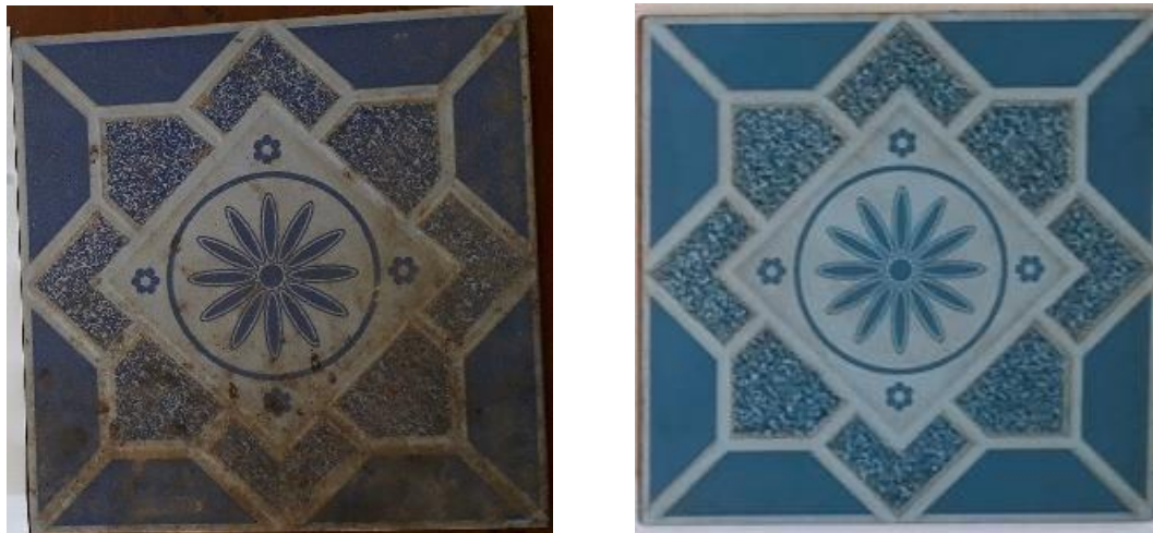
Figure 2. Comparison of ceramic samples: (a) dirty ceramics that are difficult to clean, (b) ceramics that have been cleaned with a floor-cleaning formula